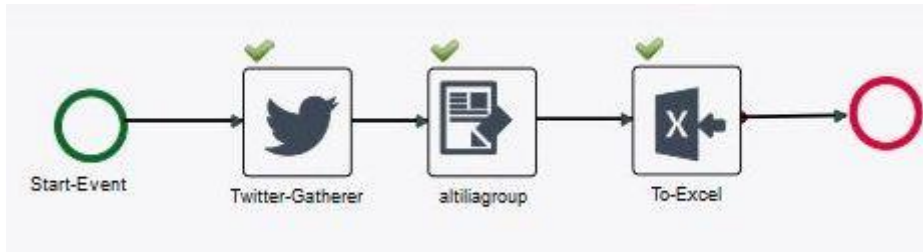
Figure 3 - simple annotator workflow example

You can set input parameter and watch the results by the watcher button as shown in the following Figure 4.