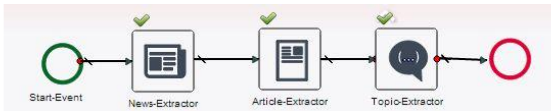
Figure 3 - Simple twitter-follow example.

You can set input parameter and watch the results by the watcher button as shown in the figure 4: